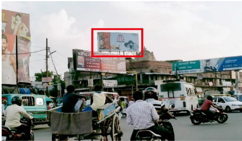
Railway Station Circle Kailash Building Rooftop Size 30x15ft