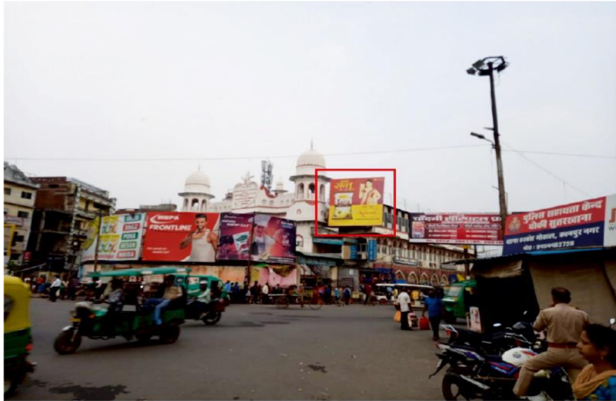
Ghantaghar Circle Hoarding