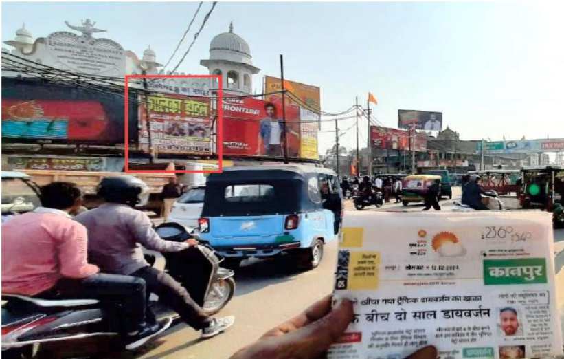
Ghantagarh Circle Central Dharmshala - Size : 10x15ft - Vertical